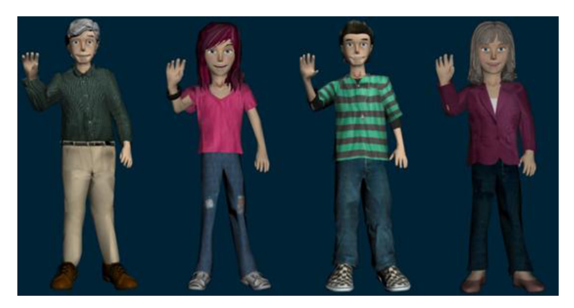
Fig. 1. Agents. Left to right – old male, young female, young male, old female; old female agent was not provided as a choice in the preliminary study.